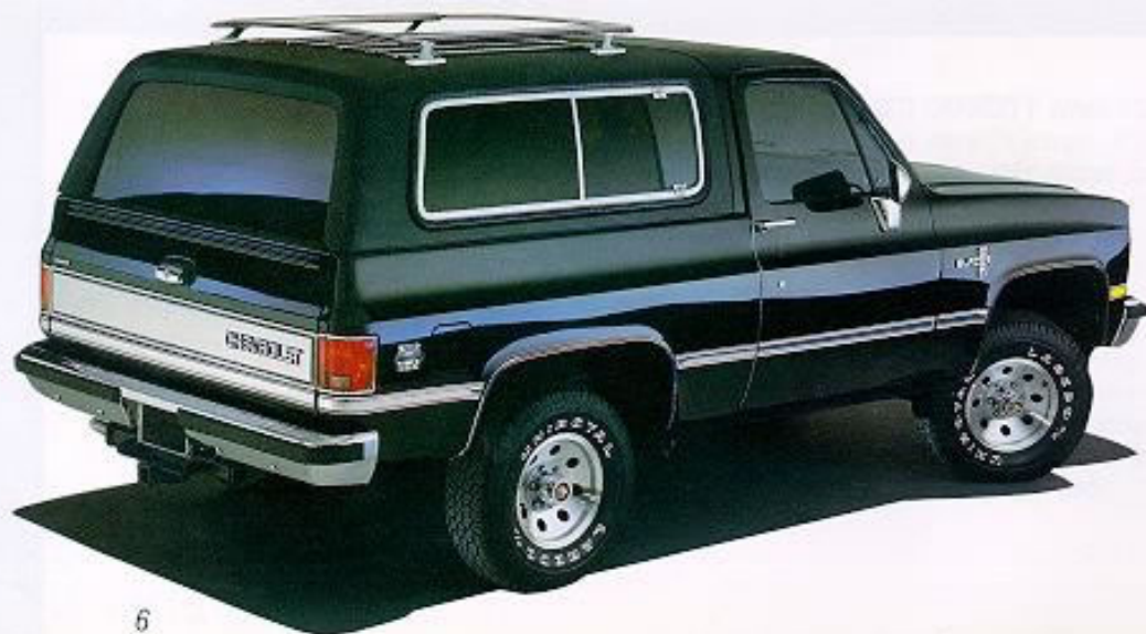
Full-size Blazer in Black, shown with the following optional items: Silverado trim, luggage rack (dealer-installed), deep-tinted windows, sliding rear side windows, power rear window, white-letter tires and aluminum wheels. Tires supplied by various manufacturers.