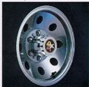
Optional aluminum wheels.