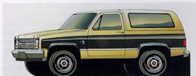
Shown on cover: Full-Size Blazer with optional Exterior Decor Package in Doeskin Tan and Apple Red and optional Silverado trim. Tires supplied by various manufacturers.