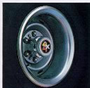
Optional Rally Wheels (standard on Silverado).