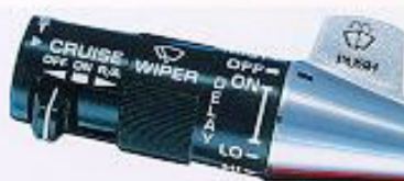
Optional electronic speed control and intermittent wipers are on the standard multi-function lever.