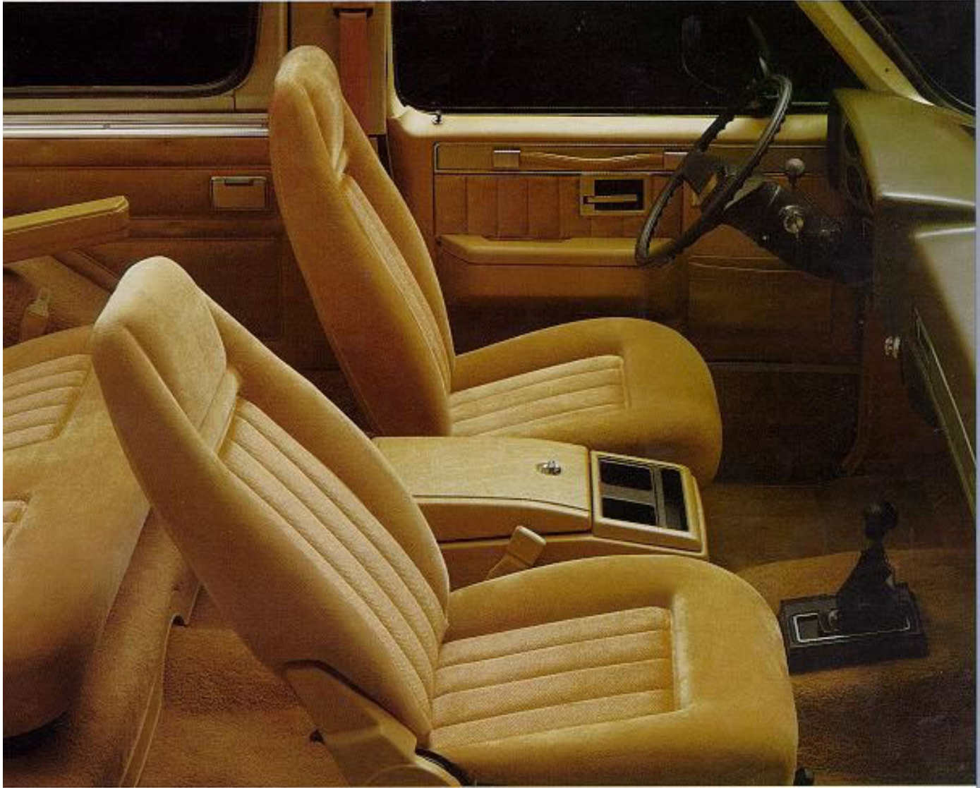
Optional Silverado interior trim in Saddle with Custom Cloth.