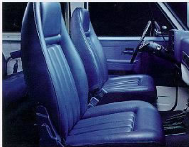
Standard (Custom Deluxe) interior with Custom Vinyl.

bucket, it automatically slides forward to provide passage, then returns easily to position.