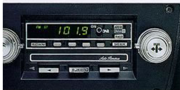
Optional Delco AM/FM stereo radio with cassette tape player, Seek and Scan and digital clock.

*1987 ratings. See your dealer for 1988 ratings. (A) Produced in U.S. and Canada.