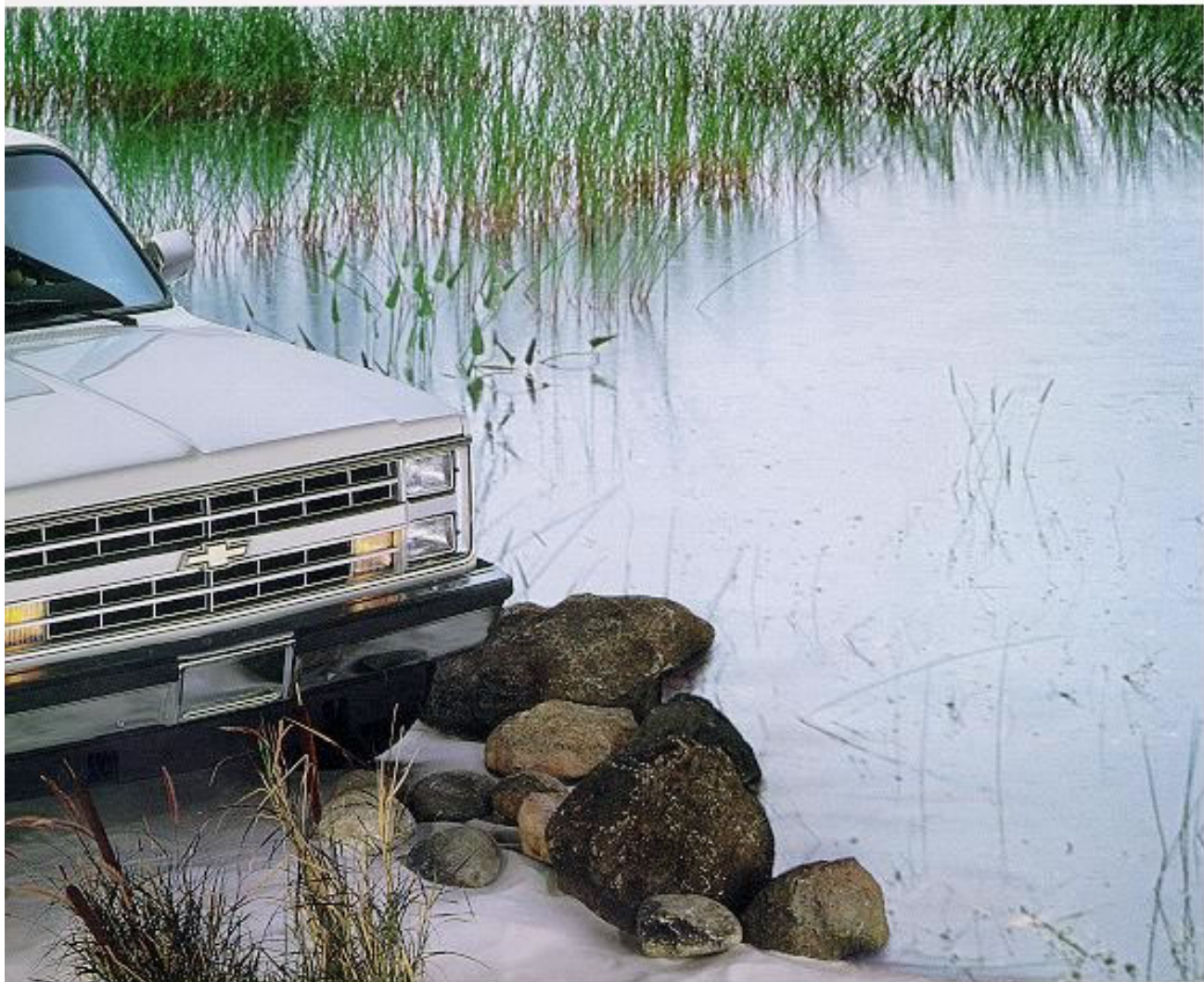
Full-Size Blazer in Frost White with optional Silverado trim. Tires supplied by various manufacturers.