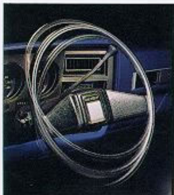
Optional Comfortilt steering wheel.