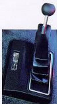
Transfer case shift lever with 2WD/4x4 indicator.