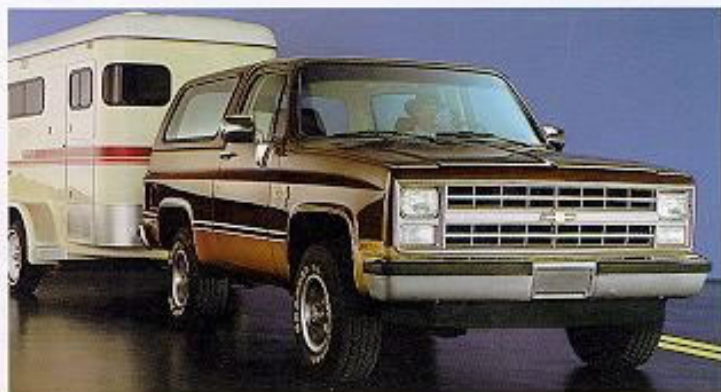
Full-Size Blazer with Special Two-Tone paint. A properly equipped Blazer can move up to 12,000 lbs., including vehicle, trailer, passengers, cargo and equipment.