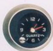
Quartz electric clock