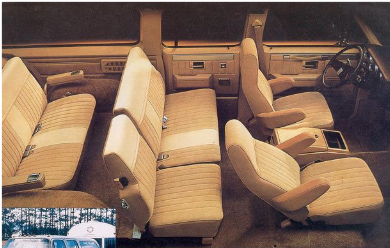
Sierra Classic with available seating