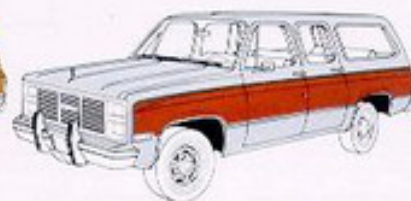
Available Exterior Decor Package