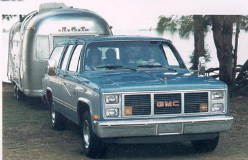
C-2500 Suburban with 7.4 Liter V8 gas engine is in a trailering class by itself (See below)