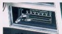
Front air conditioning