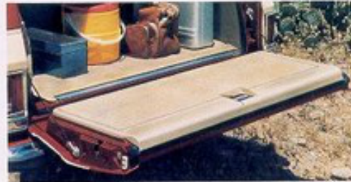
Wagon-type tailgate offers available power drop glass, with or without electric defogger.