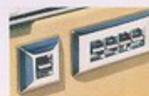
Power door locks and/or power windows