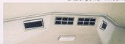
Rear air conditioning (requires front air conditioning)