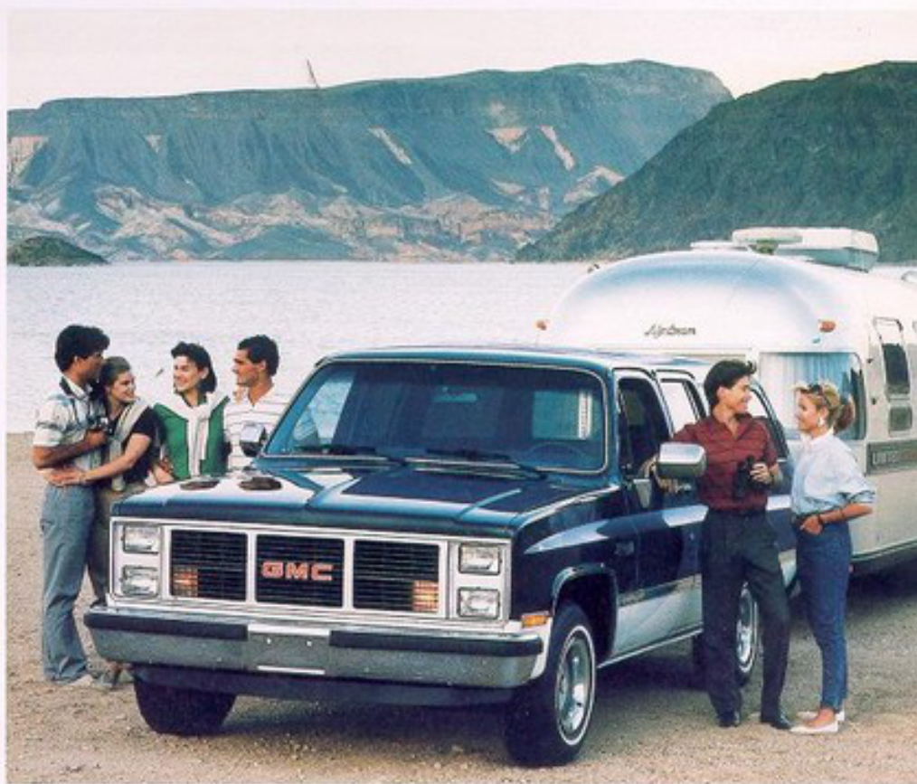
Sierra Classic Suburban with available equipment