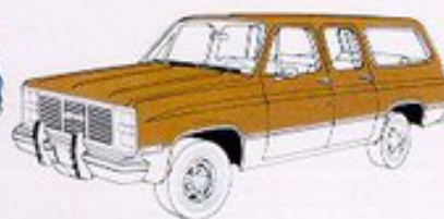
Available Special Two-Tone