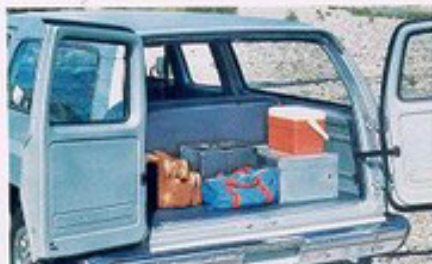
Panel-type rear doors have fixed, tinted glass; opening is 37" high by 59.6" wide. Power door lock available.