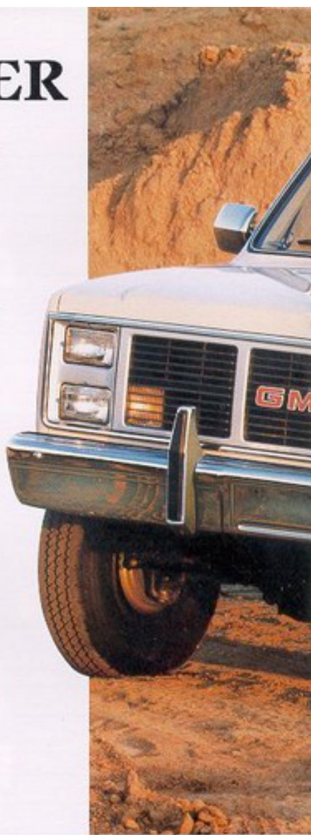
Sierra Classic 4-WD Suburban with exterior decor package and other available equipment

Suburban is equipped with standard power brakes, power steering, and front stabilizer bar for easy handling wherever you travel. For tackling really rugged work you may wish to add available heavy-duty front spring package; or heavy-duty front quad shock absorbers; locking differential rear axle; and stone shields for the fuel tank and transfer case. (Also see standard and available equipment pages 6 through back cover.)