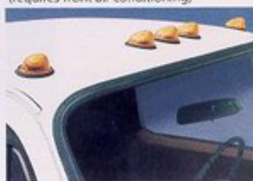
Roof marker lamps