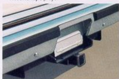
Platform trailer hitch (requires Trailering Special Equipment)