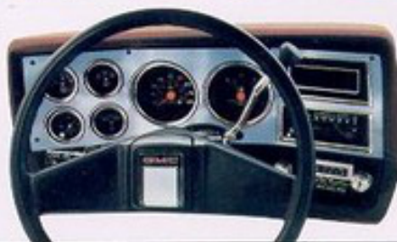
Sierra Classic instrument cluster with needle-type gauges for voltmeter, temperature, and oil pressure