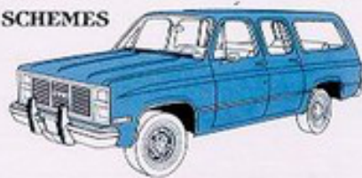
Standard Solid Paint Scheme