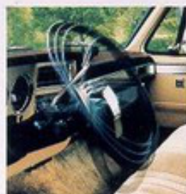
Comfortilt steering wheel

1 - Gross Combination Weight Rating with selected engine and rear axle ratios. Refer to the 1986 GMC Trailering Guide for further information. 2 - Except Series C-1500 in California 3 - Not available in California 4 - Series C-2500 only