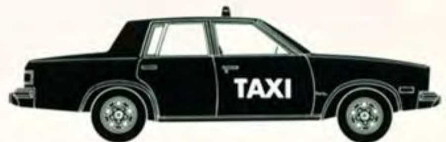
4-DOOR SEDAN 1GW69

Malibu is the mid-size with the spacious interior room and trunk capacity that prove very popular for urban police work and taxi use. Ease of maneuvering in city traffic, and into tight places is due to its smart size, power steering, and power brakes. For 1983, Malibu standard features include automatic