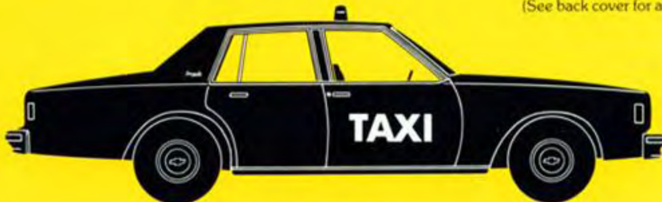
4-DOOR SEDAN 1BL69