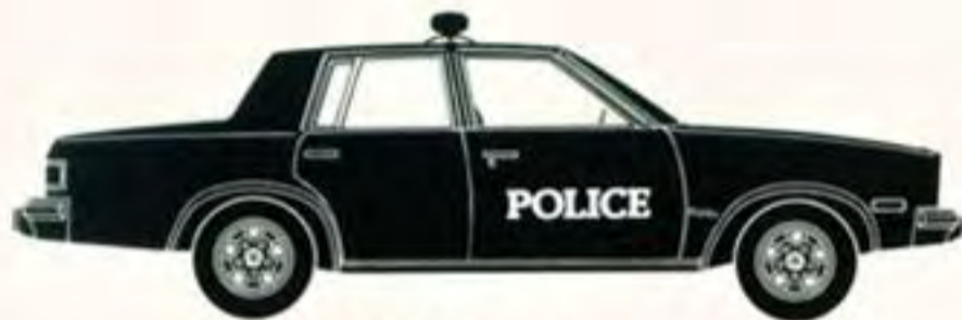
4-DOOR SEDAN 1GW69

Malibu is the mid-size with the spacious interior room and trunk capacity that prove very popular for urban police work and taxi use. Ease of maneuvering in city traffic, and into tight places is due to its smart size, power steering, and power brakes. For 1983, Malibu standard features include automatic