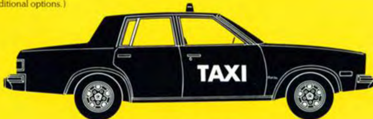
4-DOOR SEDAN 1GW69

This catalog should not be used for ordering purposes. Rather it is intended as a source of advance information for planning future vehicle fleet needs. For further details, contact your local Chevrolet dealer or the Chevrolet Zone Office covering your area.