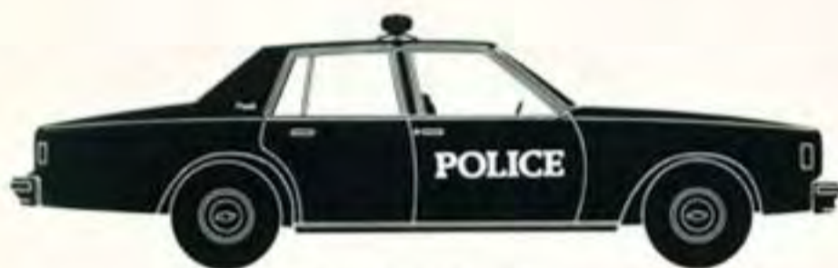
4-DOOR SEDAN 1BL69

IMPALA full-size room and comfort for six adults.