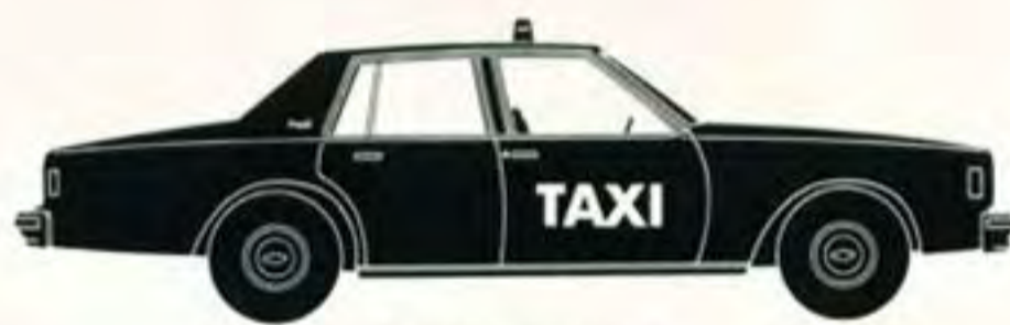
4-DOOR SEDAN 1BL69

Impala continues to be the full-size value for which it's been famous these past 24 years. Impala is equipped with Computer Command Control, an on-board computer that monitors engine functions and fine-tunes the engine's performance under all normal operating conditions—continuously—as you