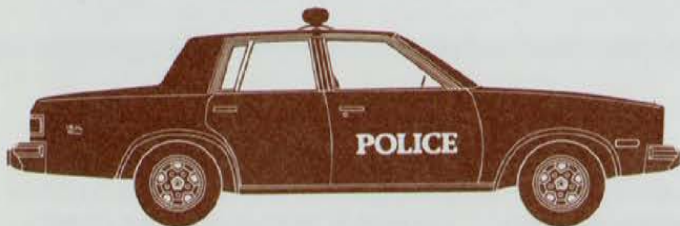
4-DOOR SEDAN 1GW69

GENEROUS ROOM. SENSIBLE MID-SIZE. EASY TURNING AND MANEUVERABILITY IN CITY TRAFFIC.