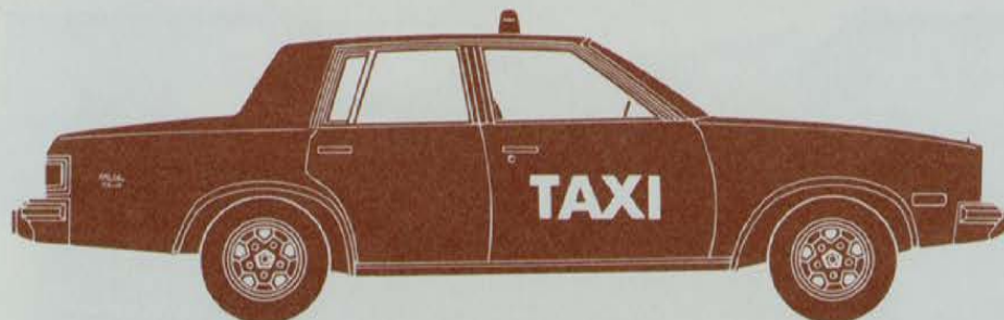
4-DOOR SEDAN 1GW69