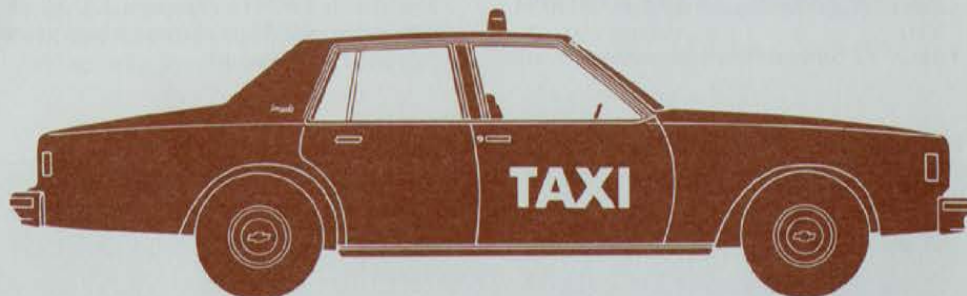
4-DOOR SEDAN 1BL69