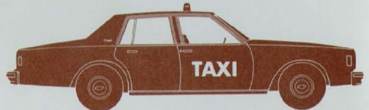
4-DOOR SEDAN 1BL69

Impala continues to be the full-size value it's been famous for these past 23 years. For '82, we invite you to examine it with an eye on technology. Impala is equipped with Computer Command Control, an on-board computer that monitors engine functions, and fine-tunes the engine's performance under all normal operating conditions—