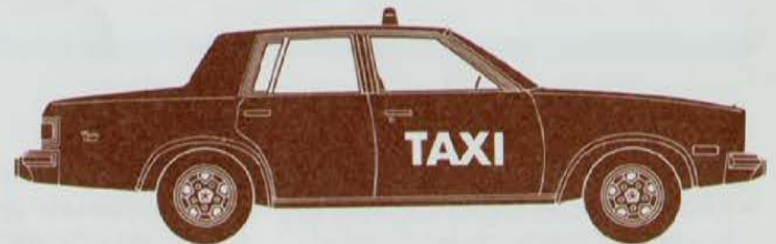
4-DOOR SEDAN 1GW69

The popularity of the Malibu Classic in police work proves its mid-size and generous overall interior room and trunk capacity make it an ideal vehicle for urban police and taxi duty. For 1982, Malibu Classic standard features include Computer Command Control, Easy-Roll tires, side-lift frame jack, improved windshield washer system and power