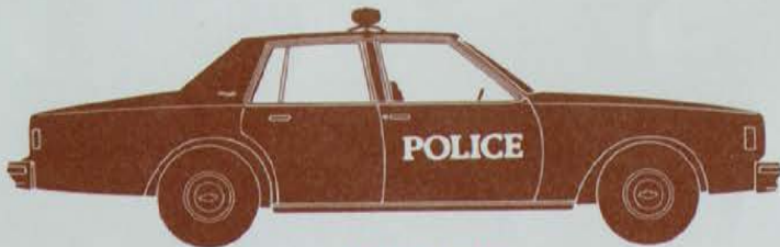
4-DOOR SEDAN 1BL69

FULL-SIZE ROOM AND COMFORT FOR SIX ADULTS. RESPONSIVE AND AGILE FOR CITY OR HIGHWAY.