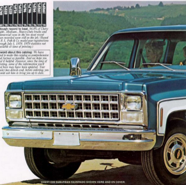
CHEVY C20 SUBURBAN SILVERADO SHOWN HERE AND ON COVER.

A word about this catalog: We have tried to make this catalog as comprehensive and factual as possible. And we hope you find it helpful. However, since the time of printing, some of the information you'll find here may have been updated. Your dealer has details and, before ordering, you should ask him in being you up to date.